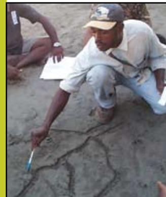
A map of the Opao-speaking communities is sketched in the sand.

During the last six years, SIL in PNG has worked alongside ethnolinguistic communities to formulate initial alphabets for 108 languages. The PNG Department of Education sponsored this initiative with funds from the Australian government.