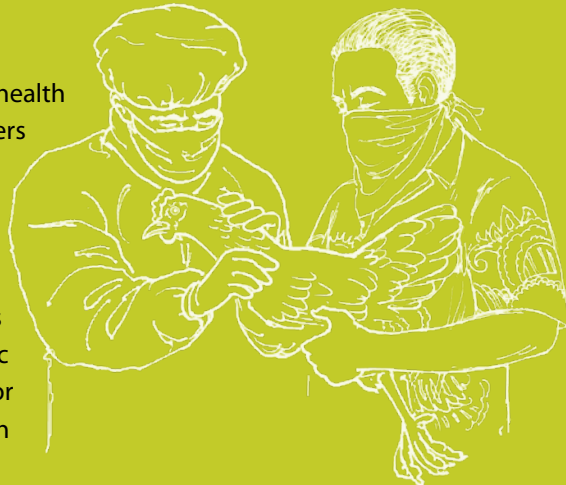
The easily-translated booklet about Avian Flu contains many line drawings.

http://www.sil.org/literacy/materials/health/avian_flu