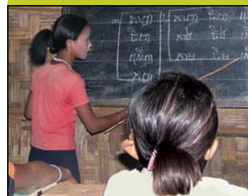
Sustainable multilingual education is achieved when communities work together.

Representatives from ethnolinguistic communities in Bangladesh interacted with local development and education practitioners. Reports underscored the fact that most successful MLE programs are those that support the human rights of ethnic minority communities—including the right to quality education.