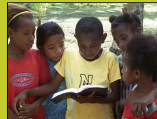
Indonesian children read a newly-printed book in their mother tongue.

The seminar’s theme, “Building a Nation through Literacy Education,” raised awareness about the importance of language education—beyond traditional literacy skills—to survival in modern and global communities. Some topics addressed were: literacy as a prerequisite for nation building, literacy in multilingual communities and literacy in relation to literature.