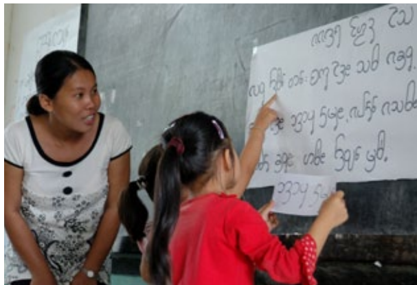
Learning to read occurs most easily in the language the learner speaks best.

Primary education programs that begin in the mother tongue help students gain literacy and numeracy skills more quickly. When taught in their local language, students readily transfer literacy skills to official languages of education, acquiring essential tools for life-long learning. The results are the growth of self esteem and a community that is better equipped to become literate in languages of wider communication.