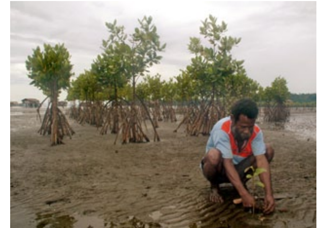
During a mother-tongue-based development project, the people of Ambai village in Papua, Indonesia, learned that clearing the mangrove areas had resulted in soil erosion.

Environmental preservation principles are communicated through literature in language development programs. As local populations learn appropriate technology while drawing on traditional knowledge of flora and fauna, they meet economic needs while protecting the environment.